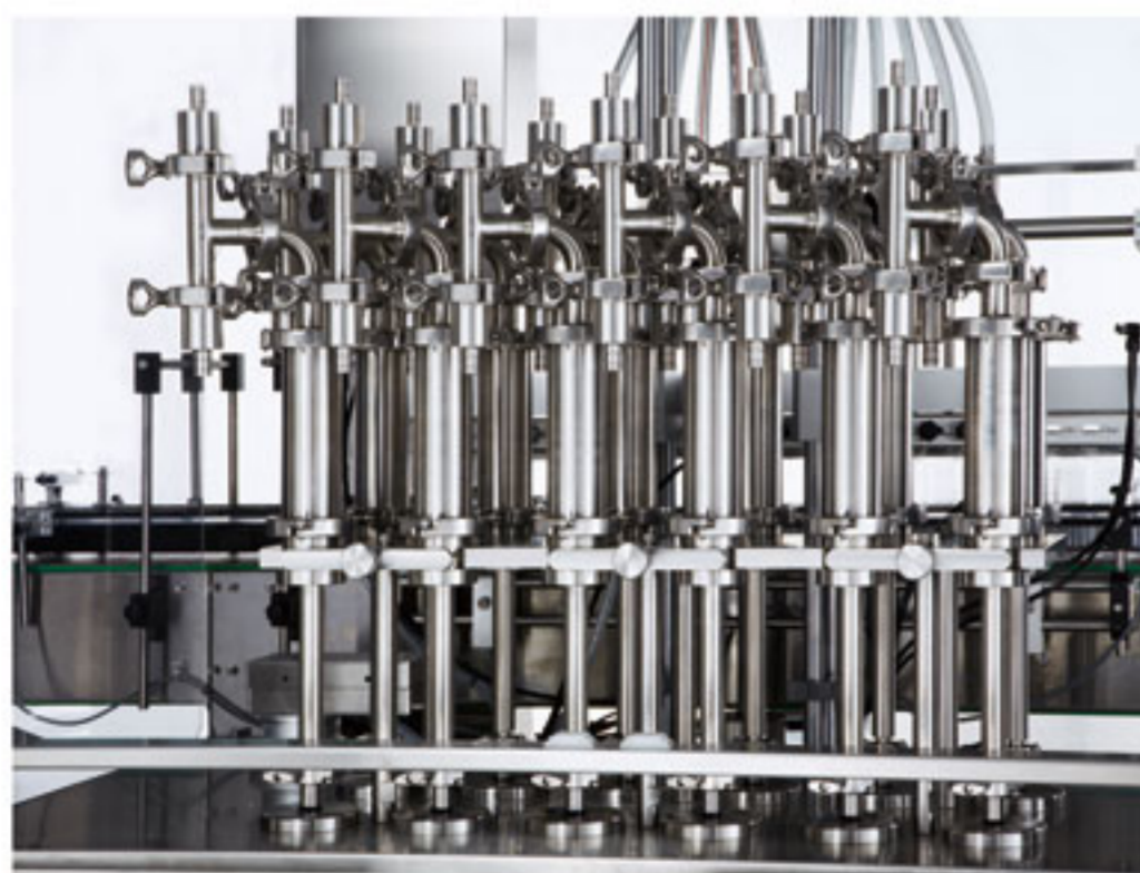
Precision concentrated heavy-walled SS316 cylinders

With all of Pack Leader's high-quality products, customers from around the world receive support exactly when they need it – benefiting from 24x7 customer service from the company's expert, U.S.-based support team.